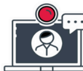
Patient Education Webinars