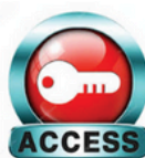
Personalized Access Support