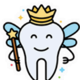
Tooth Fairy Program