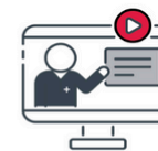
Additional Educational Programs for HCPs