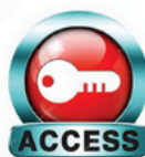
Personalized Access Support