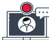
Patient Education Webinars