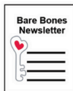
Bare Bones Newsletter